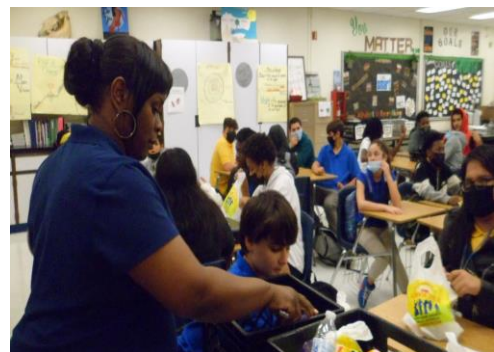
Pictured above are our T.A.L.E.N.T.S. and All-Stars programs getting ready for their activities.