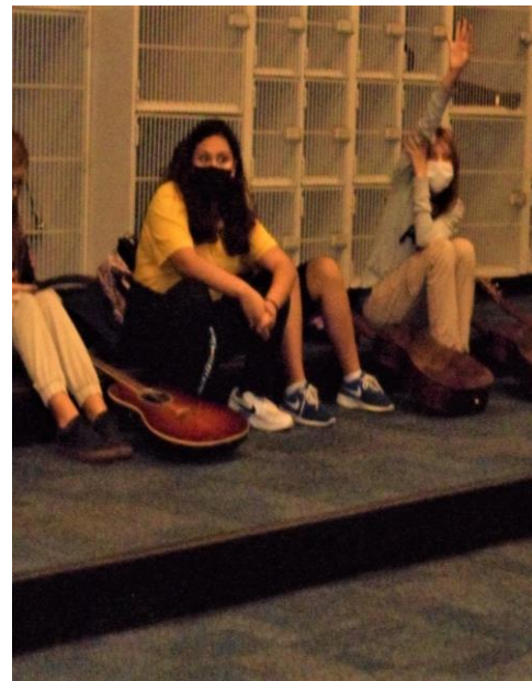
Students reciting the Guitars Over Guns pledge before they start for the day.