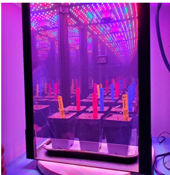
Science Club growing radishes using UV lights.