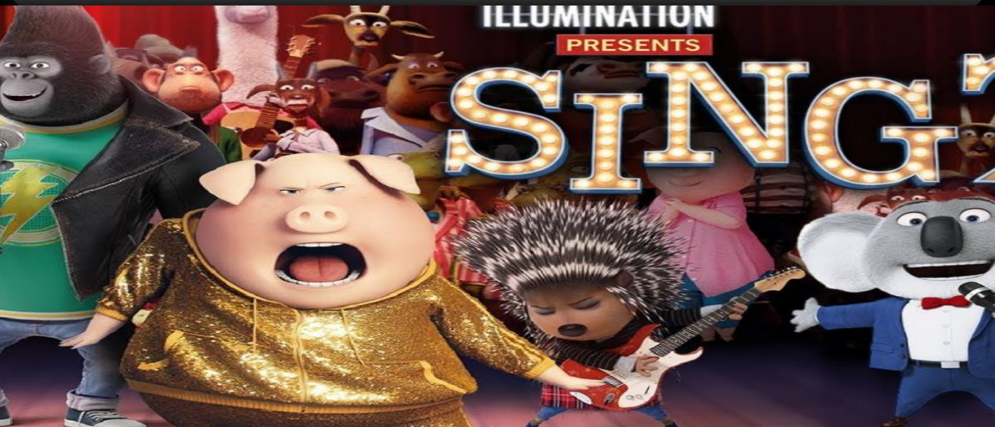
Image courtesy of AnimationXpress Team: Release date for Sing 2 is December 22 in theatres near you.