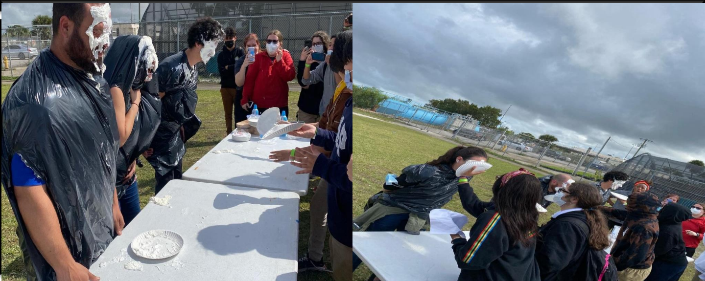
Pi Day activities with Redland's Math teachers and City Year