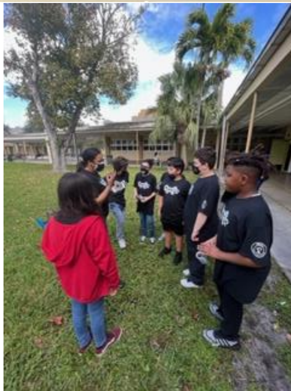
The ROBO ROYALS discussing strategies before their next match at Rockway Middle School in February 2022.