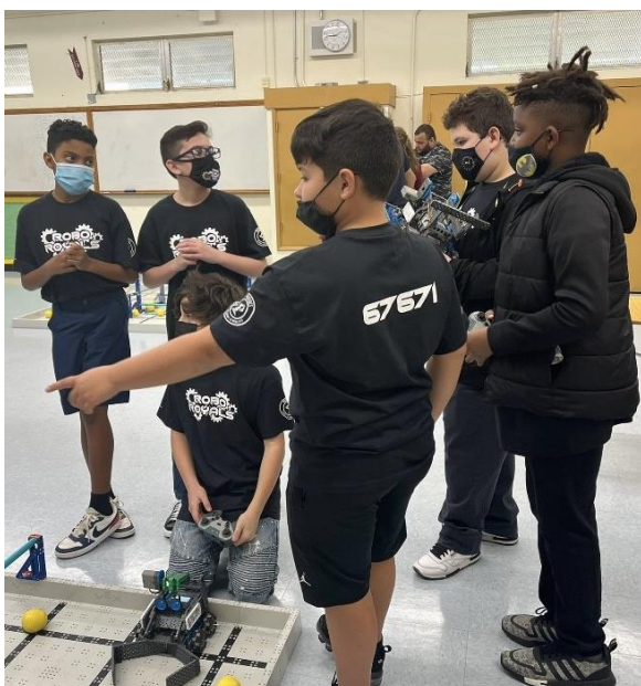
The ROBO ROYALS practicing on the field before each match.