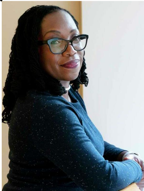
Supreme Court Justice Ms. Ketanji Brown Jackson